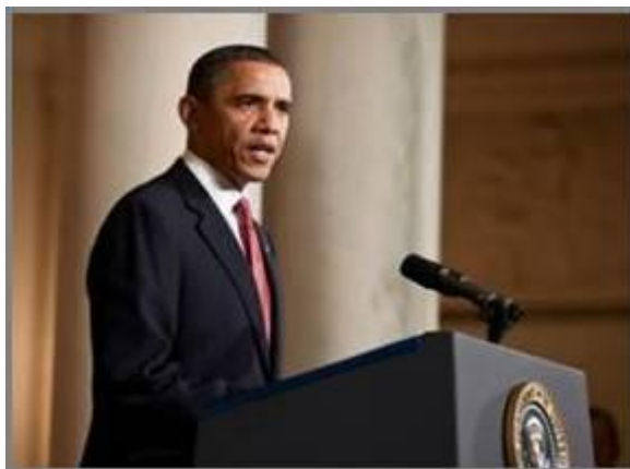
President Barack Obama

"Progress in America has not come easily, but has resulted from the collective efforts of generations. For centuries, African American men and women have persevered to enrich our national life and bend the arc of history toward justice. From resolute Revolutionary War soldiers fighting for liberty to the hardworking students of today reaching for horizons their ancestors could only have imagined, African Americans have strengthened our Nation by leading reforms, overcoming obstacles, and breaking down barriers. During National African American History Month, we celebrate the vast contributions of African Americans to our Nation's history and identity.