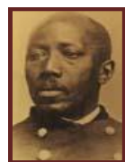
Martin Robinson Delany