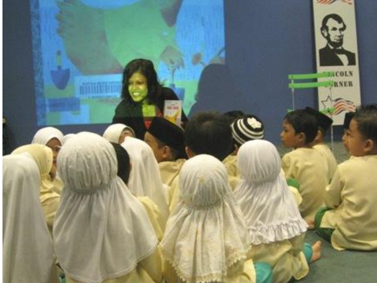
LRC librarian describing the moral of the story to the children