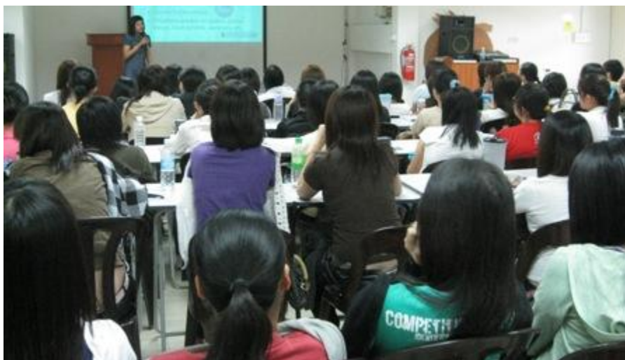
IRC librarian briefing the students about American culture.