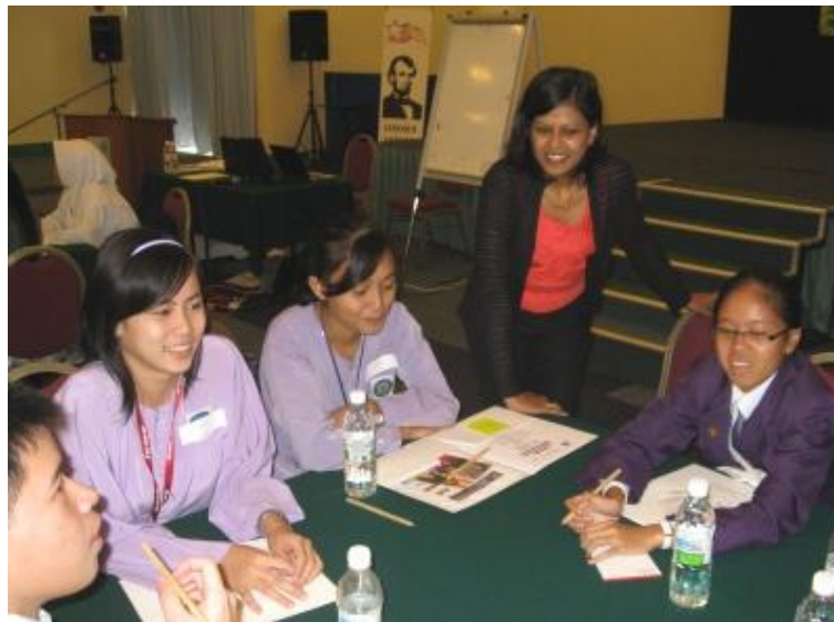
A group of students choosing a team name for their group.