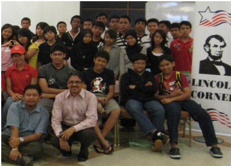
Young Adults Pose with English Program Facilitators at the Lincoln Corner