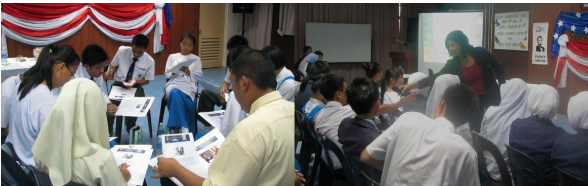
Students engaged in the Martin Luther King Jr’s discussion and group activity.